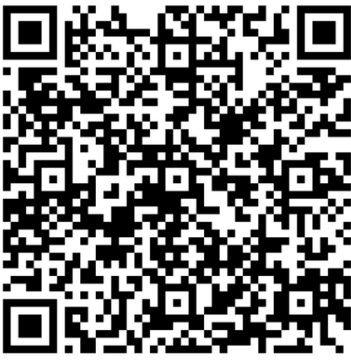
Nut Safer List 24-25

Blue Valley (BV) School's Nut Safer Guidelines for daily snacks will be implemented throughout the school year.